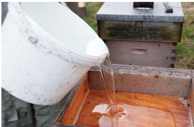
Rapid tray feeder