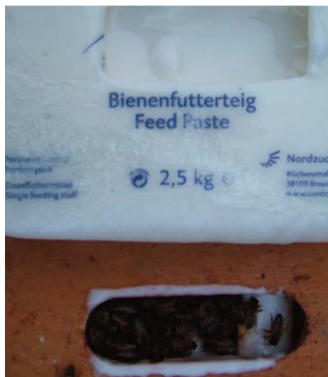
Bees eating fondant